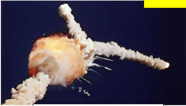
CHALLENGER SPACE SHUTTLE